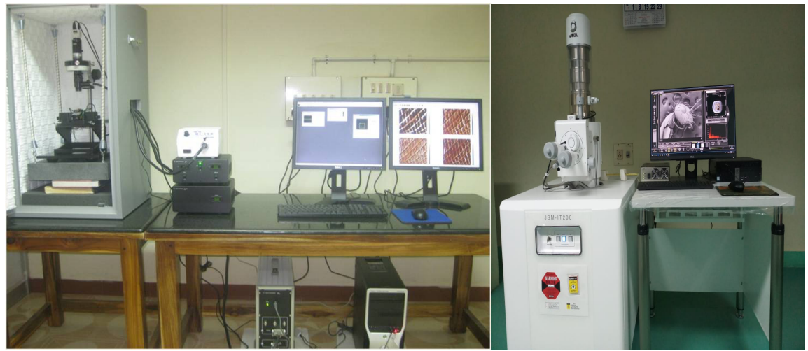
Atomic Force Microscope (AFM)