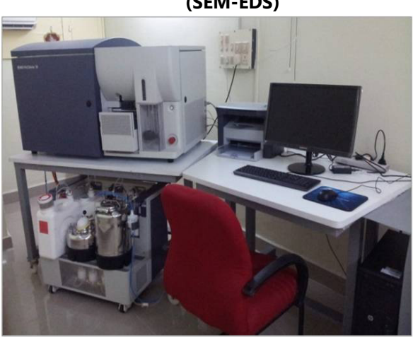
Flow Cytometer Cell Sorter (FACS)