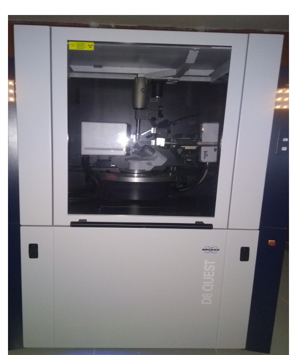
Single Crystal XRD (Brucker)